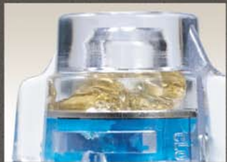
Protective dielectric sealant (water proof and corrosion proof)