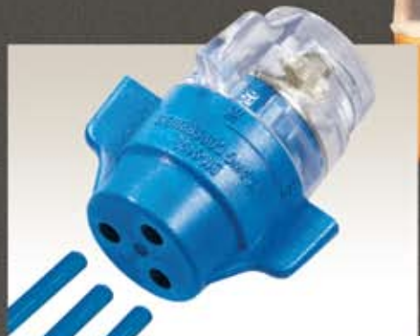
No need to remove coating from wires (less tools required, saves time and money)