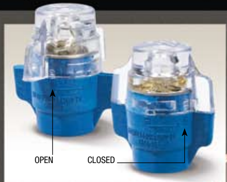
Locks shut (won't open during back-filling)