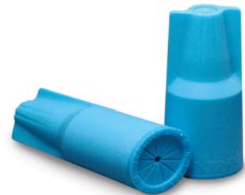
Part # SCB-01 (Blue) Box quantity 100

1. Strip wires 1/2" 2. Align conductors 3. No-pre-twisting needed. Hold stripped wires together with even ends 4. Push wires firmly into connector when starting 5. Twist connector onto wires pushing firmly until tight